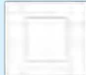
UW-19 Bath call cancelation