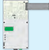
UW-18 Wireless telephone interface