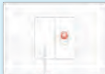
UW-14 Bath call