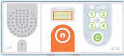
UC-104 Substation Room