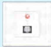
UW-13 Call Module