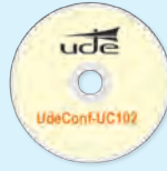
UdeConf-UC102 System configuration Software